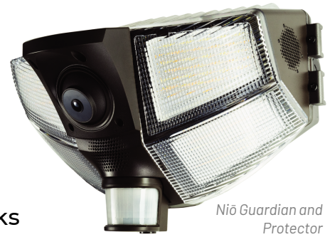
Niō Guardian and Protector